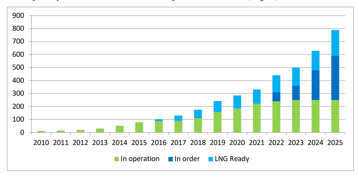
Fig. 2. Growth of LNG-fuelled fleet

At present, the Global LNG bunkering infrastructure is developing rapidly. Bunker Navigator, the SEA-LNG chart chart, provides an overview of key developments in LNG bunkering and how this growing infrastructure relates to the world's major shipping routes, presence in traditional oil bunkering ports, and the LNG infrastructure that will become the basis for ship bunkering in future. The graph also allows us to view case studies describing bunkering projects being developed by SEA-LNG members at specific locations (Fig. 2).